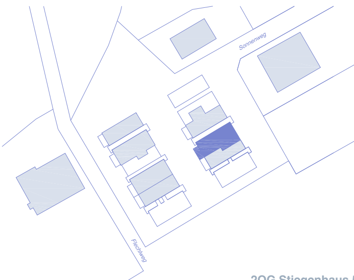
2OG Stiegenhaus 5 /2nd floor staircase 5