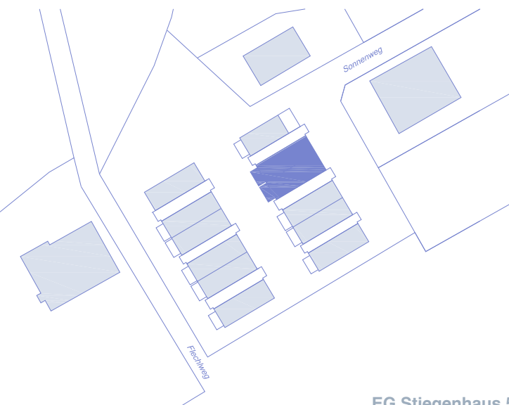
EG Stiegenhaus 5 /ground floor staircase 5